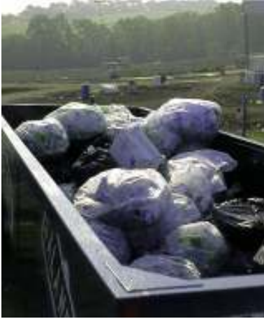
Recyclables collected at Rolling Rock Towne Fair, 2005

As this newsletter is being prepared, the day is still quite chilly, but we know that community and volunteer groups throughout the county are beginning to prepare for the summer festival season. Westmoreland Cleanways would like to remind you that we have available ClearStream Recyclers, collapsible containers for collecting recyclable plastic bottles and aluminum cans. Capturing the recyclable bottles and cans from your special event can substantially reduce the volume of trash that ends up in the landfill and will show your community that you care about our environment.